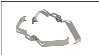
Surface Mounting Brackets (Included with Fixture)