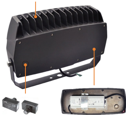
Optional 120V-277V button photocell available

High performance optics provide maximum lighting solution to your needs