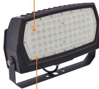
IP 65 for both Optical and Electrical chamber