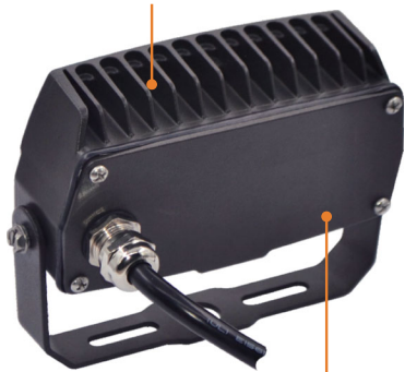
Standard 6 KV surge protection included

One piece die cast aluminum heatsink provides the most ideal heat dissipation, making the fixture cool to the touch