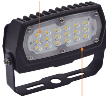
IP 65 for both Optical and Electrical chamber

High performance optics provide maximum lighting solution to your needs